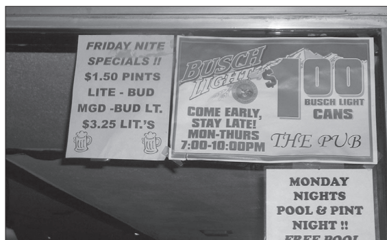
Drink specials encourage heavy drinking among all customers, some of whom may be underage.